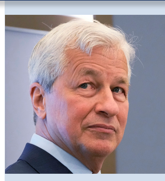
Big banks, like Jamie Dimon's JPMorgan Chase, refuse financing to American businesses that assist ICE in fulfilling our immigration laws, jeopardizing border security and the safety of our neighborhoods.<sup>2</sup>